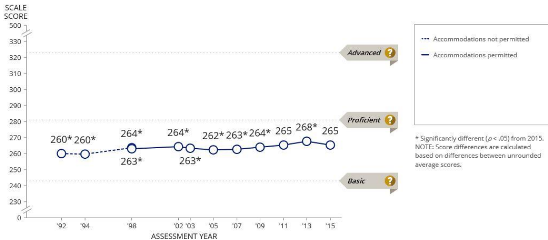
Trend in eighth-grade NAEP reading average scores

In addition to reporting scale scores, NAEP reports results at three achievement levels: Basic , Proficient , and Advanced . The cut score indicating the lower end of the score range for each achievement level is marked by a dotted line on the graphic below. Read a description of each achievement level by clicking its icon.